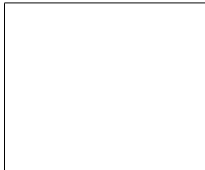
Figure 2. Remember to keep details clear and large enough.